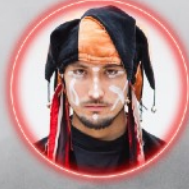
19:40 KAZUMA #BODYPOET #MARTIAL ARTS #CONTEMPORARY THEATER

28 MAY KULTURBRAUEREI PANDA PLATFORMA, KNAACKSTRASSE 97, 10435 BERLIN 12:00 - 02:00