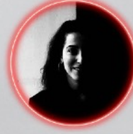
∞ ELENI TONGIDOU #SITE SPECIFIC #PERCEPTION #AMORPHOUS TIMESCALE