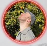
17:30 SOUNDS LIKE ANDREJ #DIY MUSIC #UPLIFTING #BACK TO BASICS