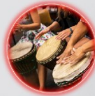
20:00 DRUMULATORS #DRUM CIRCLE #COLLECTIVE JAM #HEART MOUNTAIN