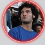
14:30 ANDREA #BREATHWORK #5D MEDITATION #HYPNOTIC EXHIBITION