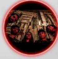
23:00 WYND #PSYCHEDELIA #STONER-ROCK #HEAVY SOUNDS