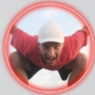
12:00 KDINDIE #CONSCIOUS MOVEMENT #ECSTATIC DANCE #COMMUNITY EXPERIENCE