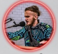
00:00 GRAY CONTRAST #PSYCHEDELIC ELECTRONIC #STREET MUSIC #MUSIC PROTEST