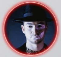
23:00 MAX BLAX #PERFORMANCE #ATMOSPHERE #STREETDANCE