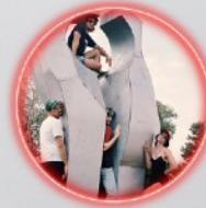
21:30 NUNOFYRBEESWAX #GARAGE ROCK #POST PUNK #PROTO-INDIE